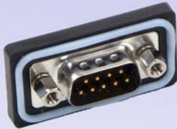
Panel Mount (DCPDB09MSC1)